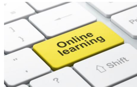
WVSU is launching fully online degrees.

WVSU is thrilled to offer new, fully online degrees beginning in August! Several bachelor's degrees and a new Master of Education in Instructional Leadership will be offered fully online this fall. Through the Master of Education in Instructional Leadership program, graduates will be able to improve teaching and learning methods in school settings by applying new techniques and concepts in instructional leadership. With two different tracks, one for candidates seeking a master's degree and one for candidates who hold a master's degree and are seeking administrative licensure.