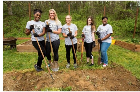
Volunteers at a worksite pause for a photo during WVSU's fourth annual Cares Day.

We would like to thank the many volunteers who helped to make this day a success, the proud alumni who participated and in some cases traveled great distances to come to campus and volunteer, as well as the out-of-state groups like the Metropolitan D.C. Alumni Chapter who helped to spread the Cares Day message beyond the valley.