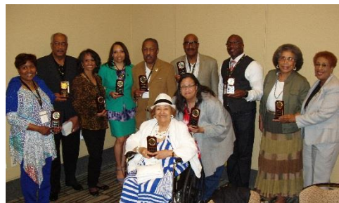
The 23rd National Alumni Association Conference was held in Chicago, Ill. at the Hyatt Regency McCormick Place, May 4-7, 2016. Pictured above are the Glover L. Smiley, Jr. 110% Award Winners present at the awards luncheon.

Support the President Brian O. Hemphill Scholarship by donating at connect.wvstateu.edu/hemphill