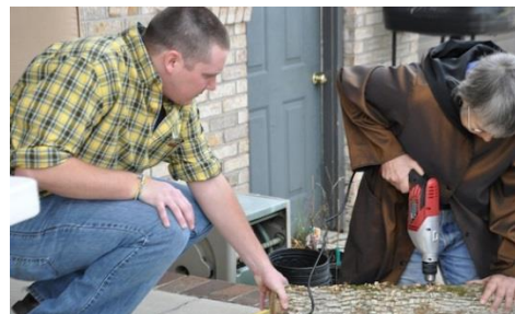
Since 2014, WVSU Extension Service has partnered with Fruits of Labor Inc. on initiatives relating to nutrition education, urban farm development and the creation of the orchard and mushroom production sites, which were made possible by West Virginia Department of Agriculture Specialty Crop Block Grants.