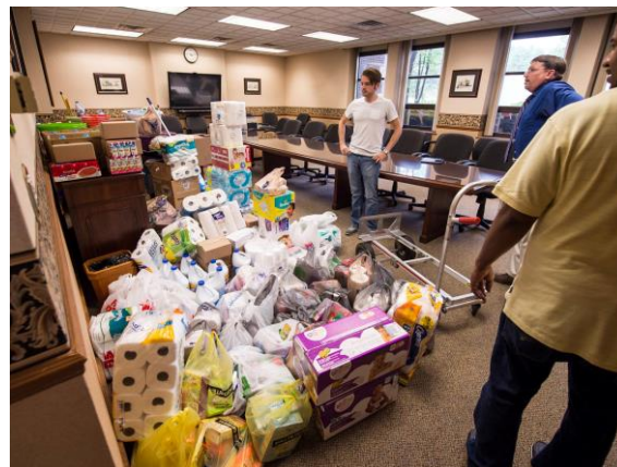
Supplies donated by members of the State Family to assist with flood relief.

The University is currently hosting more than 80 American Red Cross volunteers over the weekend as they work throughout the impacted areas. West Virginia State is truly an amazing family with a broad reach, able to make a monumental difference for many. Thank you to the countless individuals and groups who have provided much needed supplies as well as donations for the flood victims.