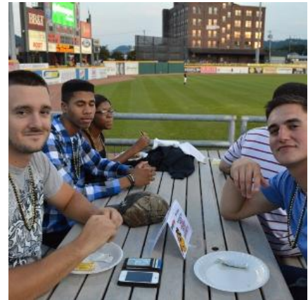
Attendees at the 2013 WVSU Night at Appalachian Power Park

Gates will open at 6:00 p.m. and the game is set to start at 7:05. Visit https://connect.wvstateu.edu/wvsu-night-at-power-park to purchase tickets for this exciting event!