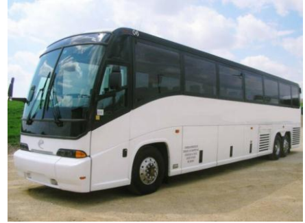
Reserve your seat on The Metropolitan Washington Alumni Chapter's charter bus to Homecoming 2014

In order to secure transportation, payment must be received no later than September 1st. No refunds after September 1st unless trip is cancelled due to low ridership.