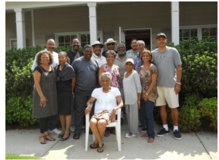
Atlanta, Ga. National Alumni Association Chapter Members