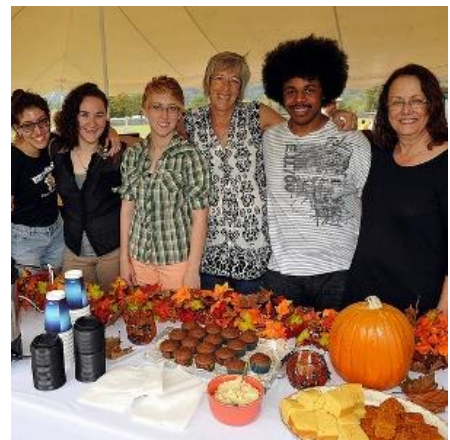
College of Arts & Humanities Tailgating Tent during Homecoming 2013

Online registration is live and printed event registration forms are being mailed to all alumni. Online event registration, a tentative schedule, lodging information, and frequently asked questions are available at connect.wvstateu.edu/homecoming .