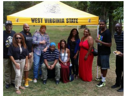
Attendees at the DC Young Alumni Cookout on August 9 in College Park, Md.

To view photos from this event, visit the Alumni Relations Flickr Page at http://www.flickr.com/wvsualumni