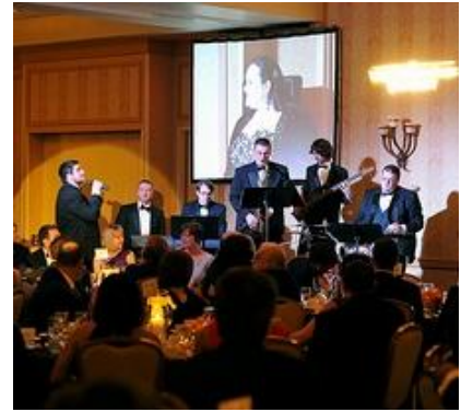
Entertainment from 2013's Black & Gold Gala

Tickets will be available online through Friday, March 21 at connect.wvstateu.edu/gala . All proceeds benefit the WVSU Foundation to support the University's programs and students.