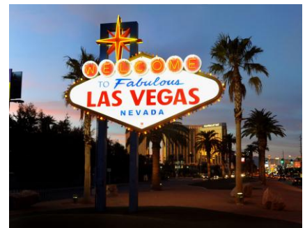
Join us in Vegas this April!