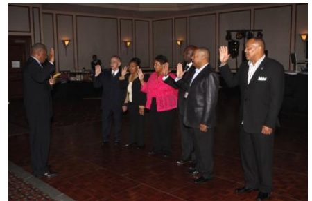
Newly elected officers being sworn in during Homecoming 2012.

Alumni are encouraged to submit nominations for candidates by April 26, 2014. To view more information about this year's elections and download nomination forms, please visit connect.wvstateu.edu/wvsunaa .